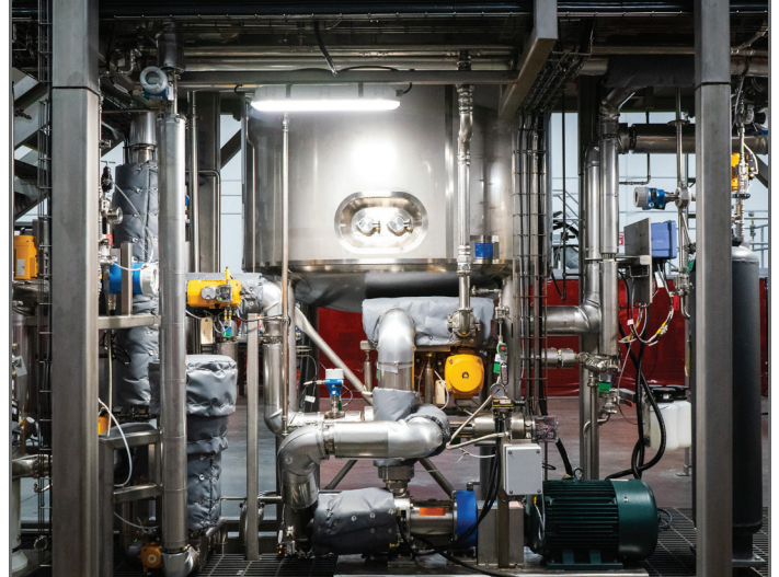
Pilot Plant designed by EPIC Systems engineers - close up of process equipment

One of the biggest challenges when designing complex process systems is ensuring the ideal amount of margin for each step in the process. Variances in processing time, recirculation loops, heating and cooling times, etc. can cause complex systems to deviate outside of desired bounds. The tighter the margin in each unit operation, the harder it is for the whole system to operate correctly. Data and testing on a pilot unit can help refine, test, and perfect this on equipment in a much less risky and expensive way.