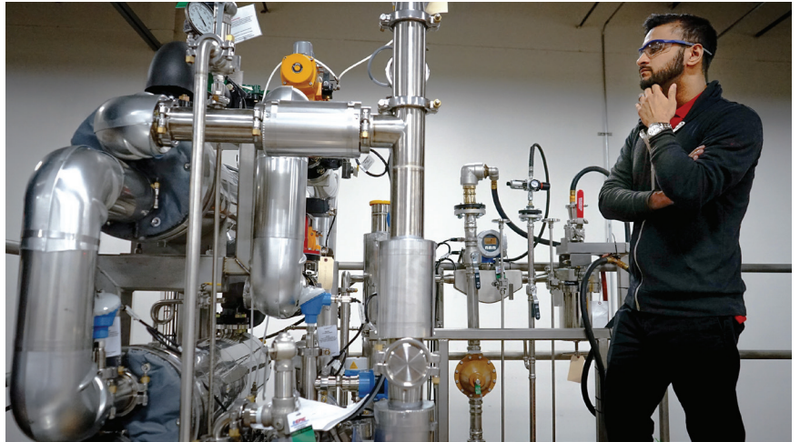
Client reviews pilot plant designed by EPIC engineers