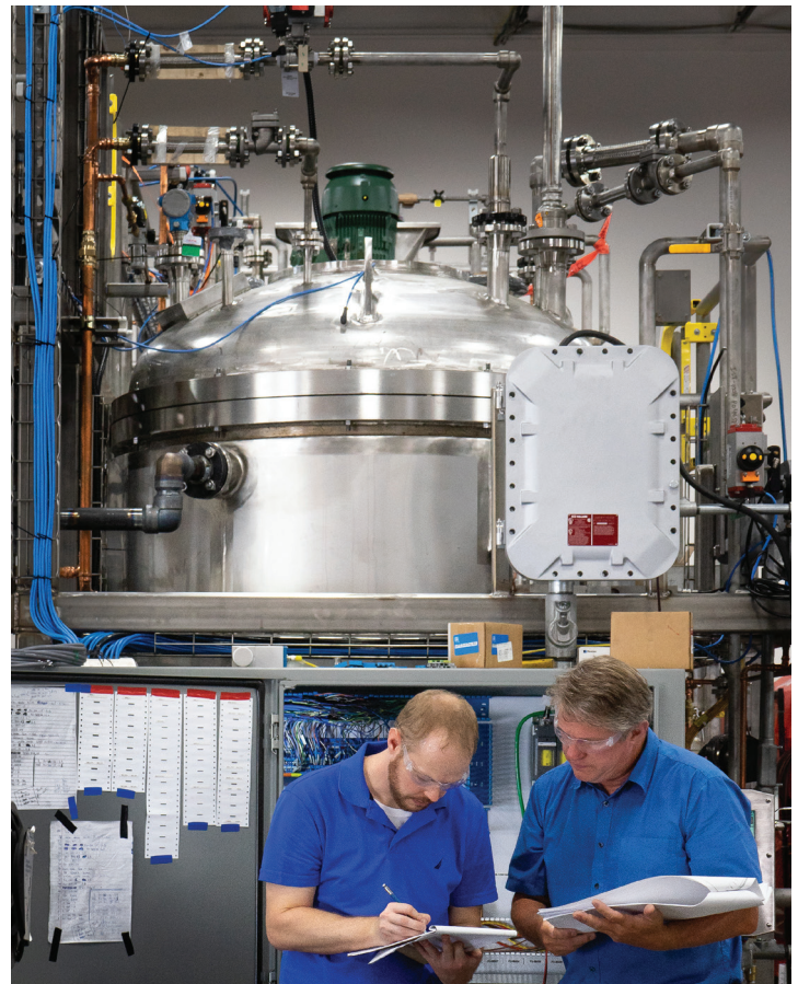
EPIC Automation Engineers run quality and control tests